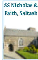
SS Nicholas & Faith, Saltash