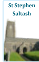
St Stephen Saltash