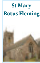
St Mary Botus Fleming