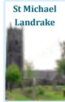
St Michael Landrake