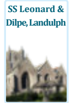
SS Leonard & Dilpe, Landulph

Love God, Serve People, Make Disciples. www.saltashteamministry.org