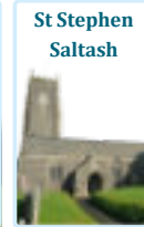
St Stephen Saltash