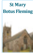
St Mary Botus Fleming