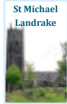
St Michael Landrake