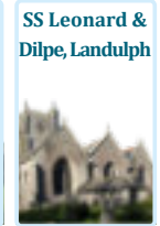
SS Leonard & Dilpe, Landulph

Love God, Serve People, Make Disciples. www.saltashteamministry.org