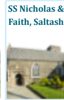
SS Nicholas & Faith, Saltash