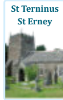
St Terninus St Erney