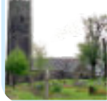
St Michael Landrake