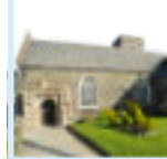
SS Nicholas & Faith, Saltash