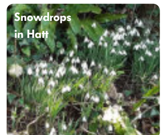
Snowdrops in Hat