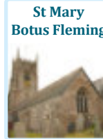
St Mary Botus Fleming