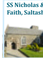
SS Nicholas & Faith, Saltash