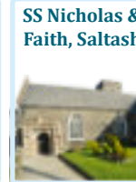
SS Nicholas & Faith, Saltash