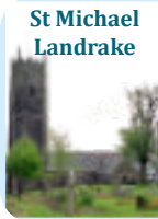
St Michael Landrake