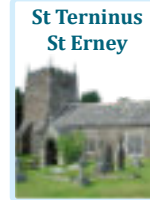
St Terninus St Erney