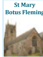
St Mary Botus Fleming