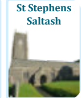
St Stephens Saltash

A holy place in Saltash, a holy place for Saltash, and a place to encounter the holiness of God in Jesus Christ our Lord. www.saltashteamministry.org