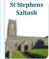
St Stephens Saltash

A holy place in Saltash, a holy place for Saltash, and a place to encounter the holiness of God in Jesus Christ our Lord. www.saltashteamministry.org