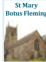
St Mary Botus Fleming