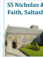
SS Nicholas & Faith, Saltash