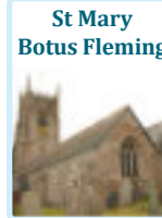
St Mary Botus Fleming