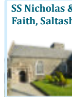
SS Nicholas & Faith, Saltash